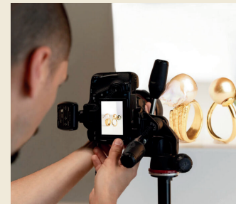
Photography & Videography