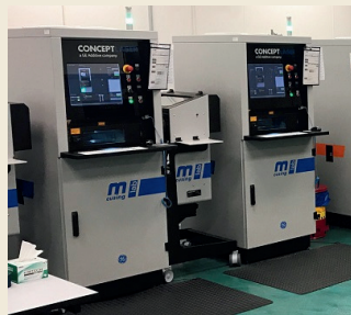
3D Printing – Metal