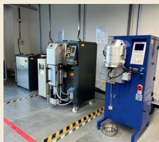
Casting (Gold, Platinum & Silver)