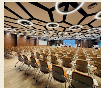
375-Seater Multi-purpose Hall

Bharat Ratnam – Mega Common Facilitation Centre, Gate No. 4 & 5, SEEPZ Special Economic Zone, Andheri (E), Mumbai – 400096.