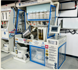
Refining (Gold, Platinum & Silver)