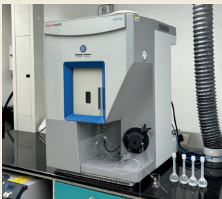
LAB Testing - Trace Metal Analysis (ICP)