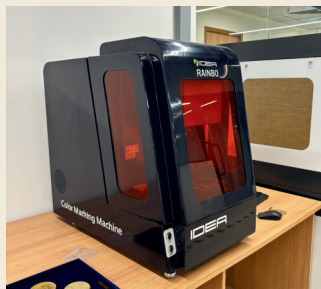
Colour Laser Engraving