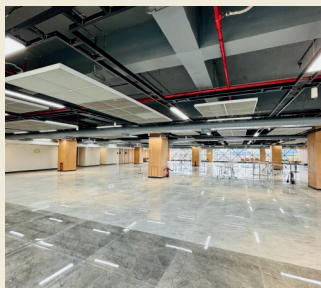
10,000 sq ft - Exhibition Centre