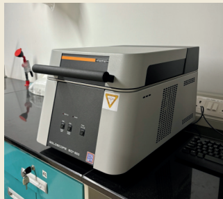
LAB Testing - XRF