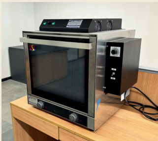
Enamelling / Coating