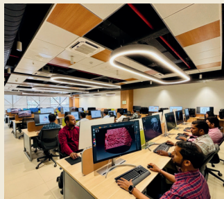
CAD & CAD Rendering