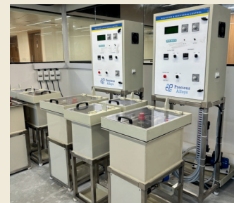
Micron Plating / Rhodium Plating