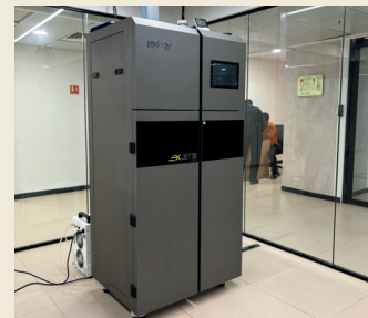
3D Printing - Resin & Wax