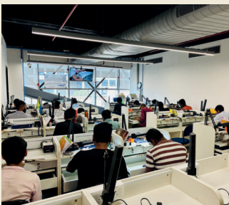
Training & Skilling School